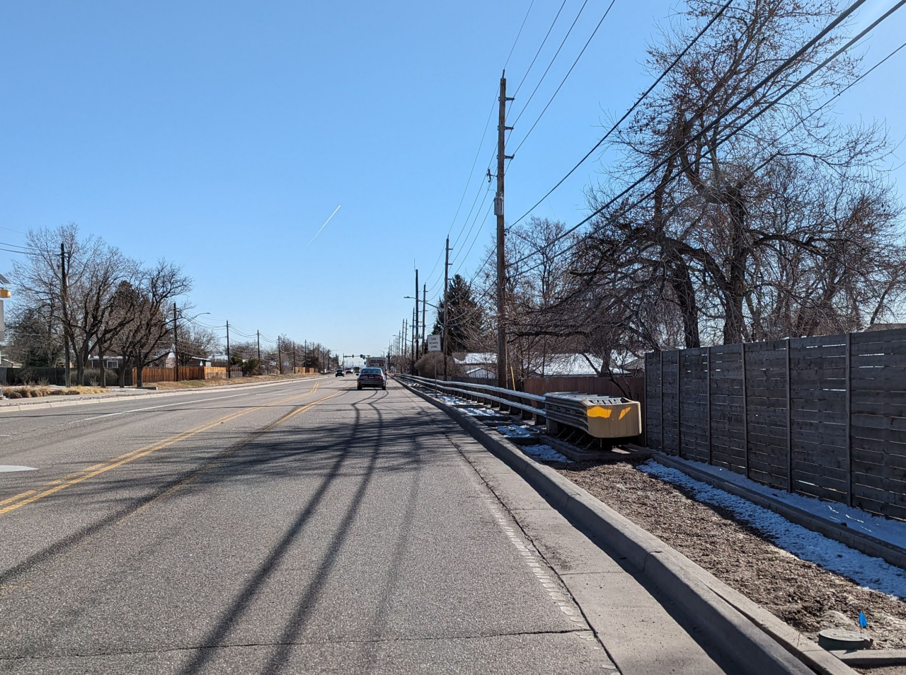
Existing curb and guardrail